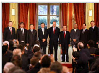
The signing of the ITER Agreement on 21 November 2006 at the Élysée Palace, in Paris.

The idea of ITER as an international experiment was first proposed in 1985 and started as collaboration between the former Soviet Union, the United States, the European Union and Japan under the auspices of the International Atomic Energy Agency (IAEA). Premier Gorbachev, following discussions with President Mitterand of France, proposed to President Reagan that an international project be set up to develop fusion energy for peaceful purposes. A collaboration between the Soviet Union, the United States, the European Union and Japan