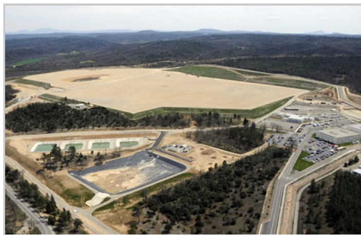
An aerial view of the ITER construction site in Cadarache, France, June 2010.

It is a very important step to bring together the most advanced nations in the world to co-operate in the development of a major potential new technology. The challenges of the ITER project require the best technological and scientific expertise, which can best be harnessed by pooling resources globally. The ITER Agreement is open for accession by or co-operation with other countries that have demonstrated a capacity for specific technologies and knowledge and are ready to contribute to the project.