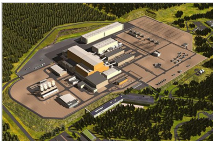
ITER artistic impression

ITER, meaning "the way" in Latin, is a major international experiment with the aim of demonstrating the scientific and technical feasibility of fusion as an energy source. It will be 30 times more powerful than the Joint European Torus (JET) which is currently the largest comparable experiment operating in the world. ITER aims to produce a significant amount of fusion power (500MW) for about 7 minutes or 300MW for 50 minutes. ITER will allow scientists and engineers to develop the knowledge and technologies needed to proceed to a next phase of electricity production through fusion power stations.