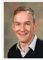
Prof Sean Freeman, Professor of Nuclear Physics”

'This was also the discovery of the proton and Rutherford showed that the “nucleus of hydrogen” existed in the nucleus of other atoms and thus appeared as a basic building block. The first nuclear reaction initiated by a human and the discovery of the proton are big steps in themselves, but from these reactions you can also infer the sizes of nuclei. It also led to the development of nuclear accelerators - so that you could induce all sorts of different nuclear reactions.