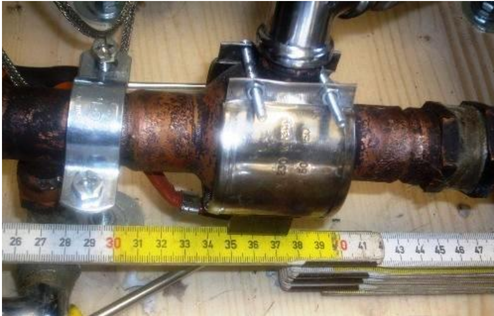
Figure 3 shows the central fuel container between the 35 and 40 cm marks on the ruler. It is about 50 cm 3 in volume.