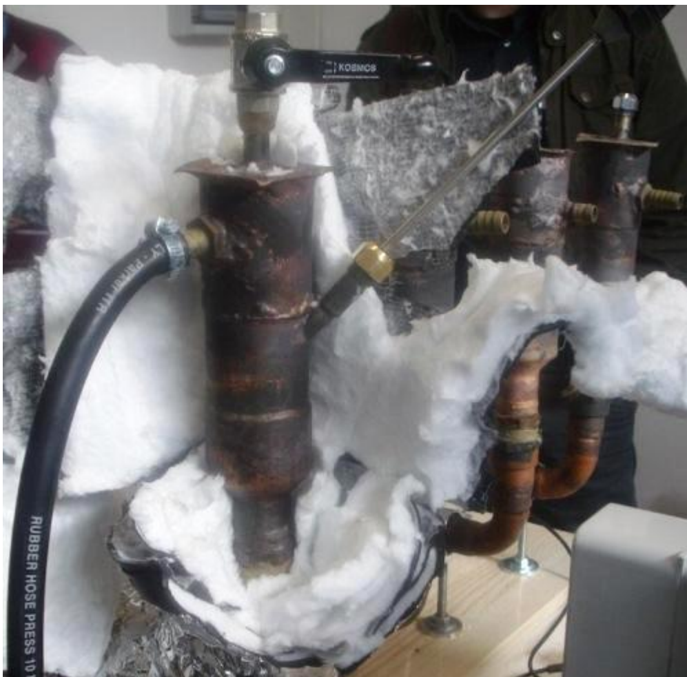
Figure 4 showing the chimney with the black outlet tubing, the thermocouple holder and on the top, the steam exhaust valve.