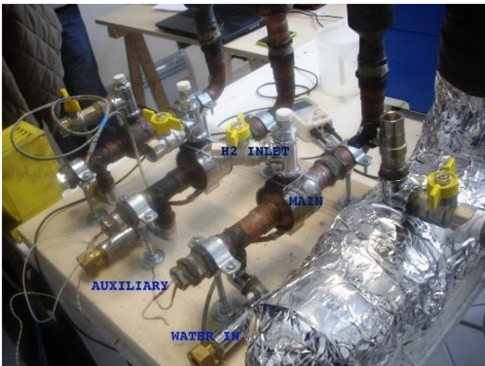
Figure 2 showing in principle the same ECATs as in figure 1 but in another perspective. (Photo: Giuseppe Levi).