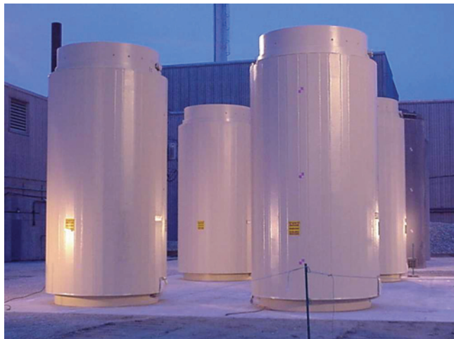
Dry storage casks for spent nuclear fuel.