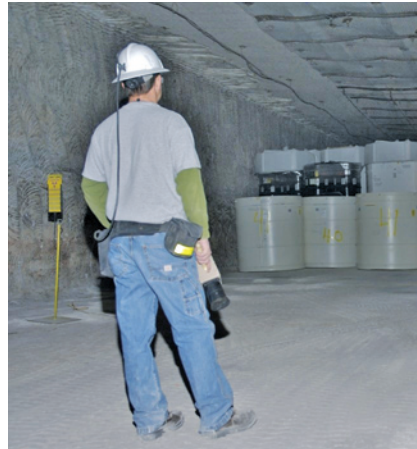
A technician watches the placement of defense-related transuranic radioactive waste at the Department of Energy's Waste Isolation Pilot Plant.

As just noted, the $1/MWhe charge for newly discharged spent fuel should be more than adequate for a long time if the approach outlined here is adopted. Allowing utilities to recover escrow fund balances in excess of what is needed for longer-term management should be a useful incentive for moving to such management when it is economically favorable.