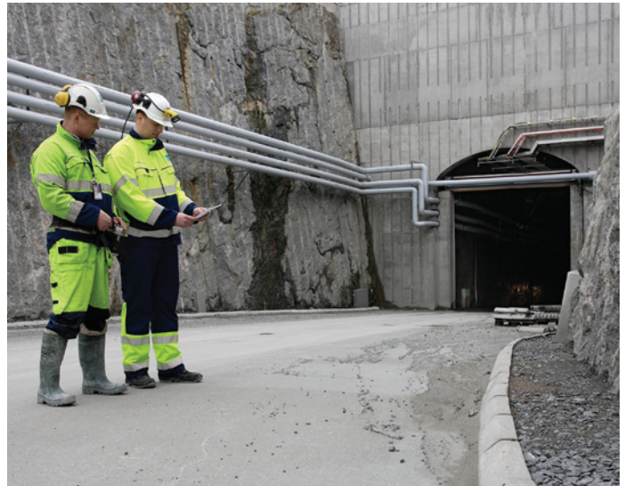
Construction of an underground repository for spent nuclear fuel in Finland.

QUESTION 5D. Should the reactor owners recover any escrow funds not deemed necessary for long-term management of spent fuel after it is moved to a long-term management facility?