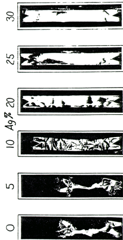
1 ~ AIR @ 8V. 30 ~ H 2 @ 8V. 1 ~ 15 SEC. HEATING - 45 SEC. COOLING

strip of palladium or palladium alloys to a stream of air, gas, or hydrogen. The metal strip, usually 1 mil in thickness, was electrically connected to a variable voltage source. The experimental arrangement allowed the experimenters to cycle the palladium alloy through various temperatures, by electrical heating of the strip, and observe how well the metal withstood the environment expected to be encountered in extracting hydrogen from a mixture of gases.