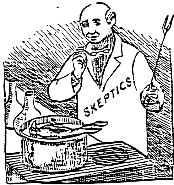
COLD FUSION COOKED CROW