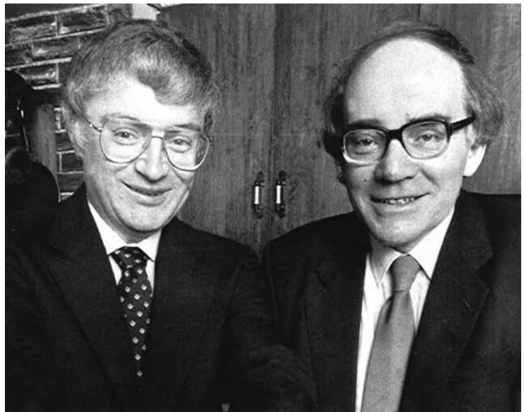
Electrochemists Martin Fleischmann (right) and Stanley Pons in 1989. They created a stir in the scientific community with their claim of achieving fusion reactions at room temperature in a tabletop experiment.

Fleischmann and Pons, to their own later regret , assumed and claimed that they had achieved a new, simpler, and cheaper route to nuclear fusion. As their announcement came at a time when traditional nuclear fusion research was suffering from continued budget cutbacks, they could not have made themselves greater political targets. Equally problematic was the fact that their proposition that nuclear reactions at high rates, with only low-energy stimuli, contradicted—not laws of physics —but 100 years of scientific opinion . That's