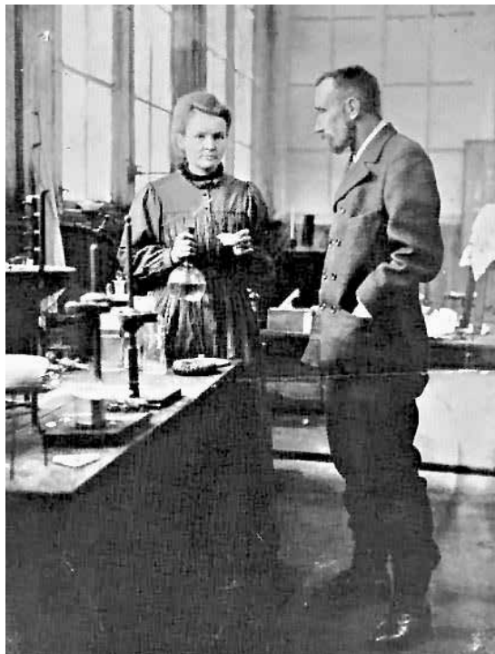
Marie and Pierre Curie in their laboratory.

The hard part is to appreciate this immense poten-