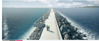
Swansea Bay Tidal Lagoon