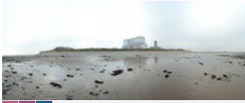
EDF Energy Strategic Partnership