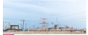
UAE nuclear new build programme