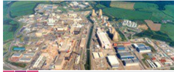
Sellafield Legacy Ponds Decommissioning