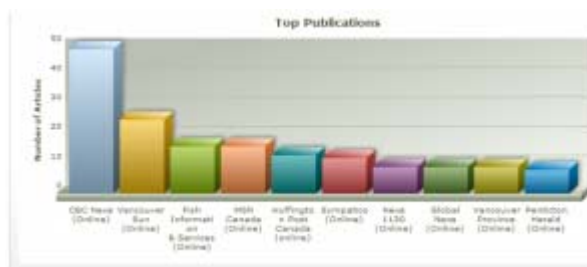
Chart Showing CBC News Domineering Role In Spread Of Disinformation. CBC is the tall blue column on the left on this data showing the first few weeks of their fabricated media frenzy. Click to enlarge