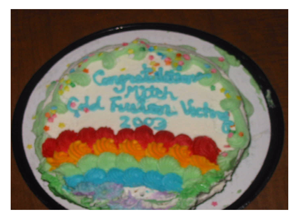
Figure 4 - The cake which Gene brought to celebrate the cold fusion excess heat results. He encouraged us to demonstrate them at ICCF-10.

We think about Gene all the time and how much he meant to us. As the photographs and record show, Gene glowed when he saw the excess heat results, and the first time he saw it in our laboratory, he brought a cake to celebrate with us.