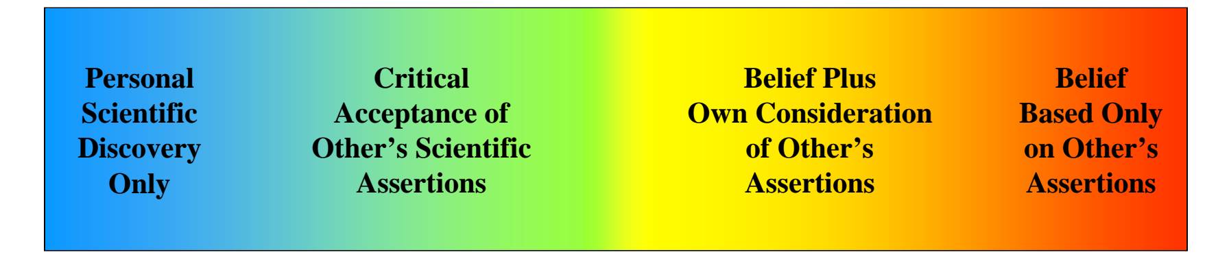
The Continuum of Science and Religion