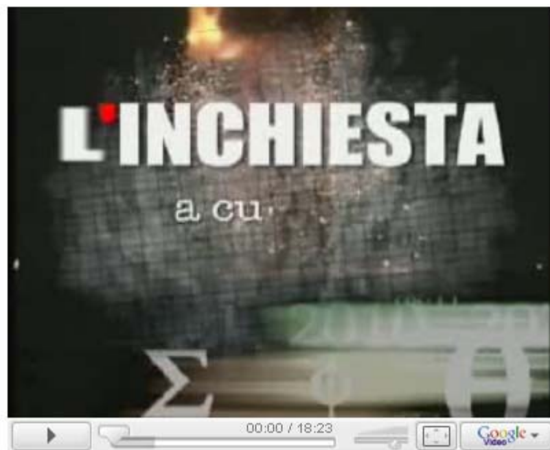
"Report 41" Italian "Cold Fusion" Documentary

Sources told New Energy Times that CBS went to Frascati, Italy, to get footage from the ENEA Frascati laboratory, the Italian Agency for New Energy. Of the 300 researchers at ENEA Frascati, two-thirds perform "hot" fusion research.