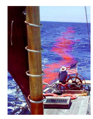
Planktos Iron Experiment 1 - June 2002

The recent work of Planktos and others in the field is opening an exciting new era of ocean stewardship. The goal is to bring management of the oceans, which cover more than 70% of this planet, in line with plant communities on land. Forests on land and at sea offer the promise to deliver powerful mitigation solutions to fight global warming. Understanding the role(s) and potential of ocean plants is a key to managing atmospheric CO2 and thus slowing the rate of global warming.