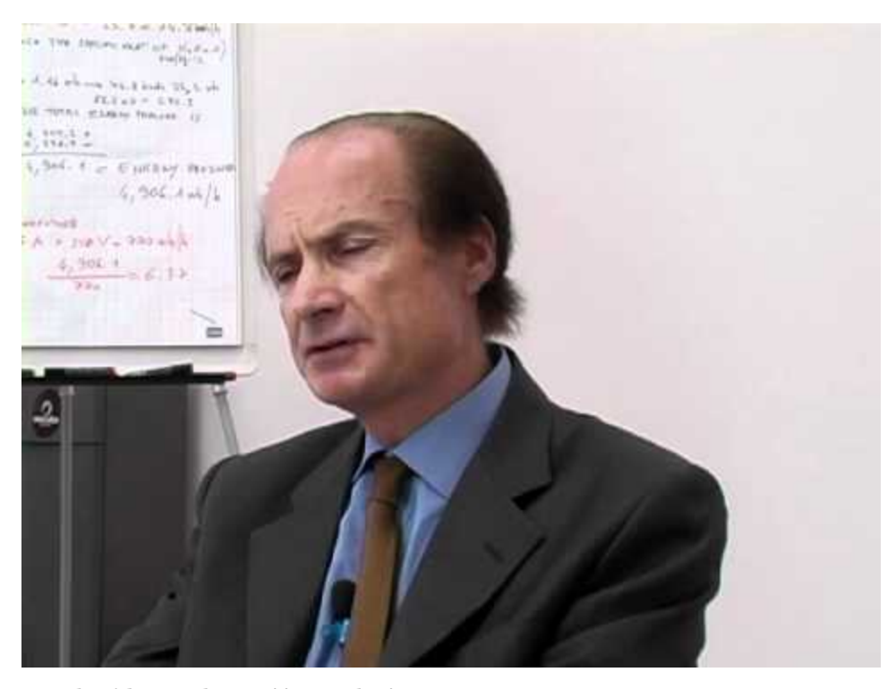
Watch Video At: https://youtu.be/II3NxxyxQoI

Within the next month, New Energy Times will release a complete timeline of the Rossi endeavors. I urge readers to examine this timeline when it is published. It should prove very enlightening to anyone interested in this matter. I also encourage readers to learn the scientific facts about LENRs. There is a reason why Rossi picked up on it — it may lead to one of the most disruptive technologies we have seen in a long time.