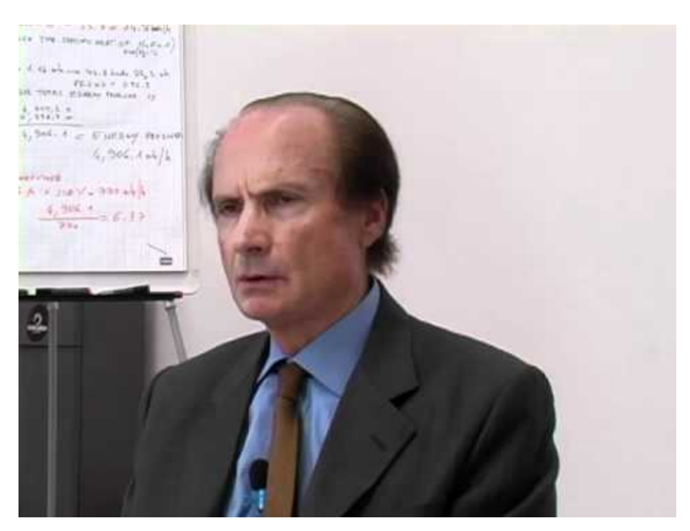
Watch Video At: https://youtu.be/9Xe6YoZVupE